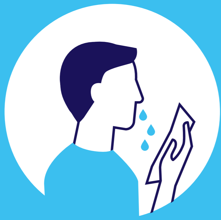
Sneezing and runny nose