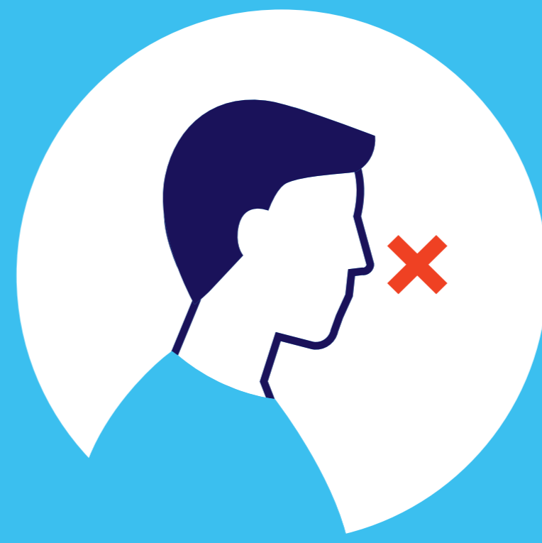
Temporary loss of smell