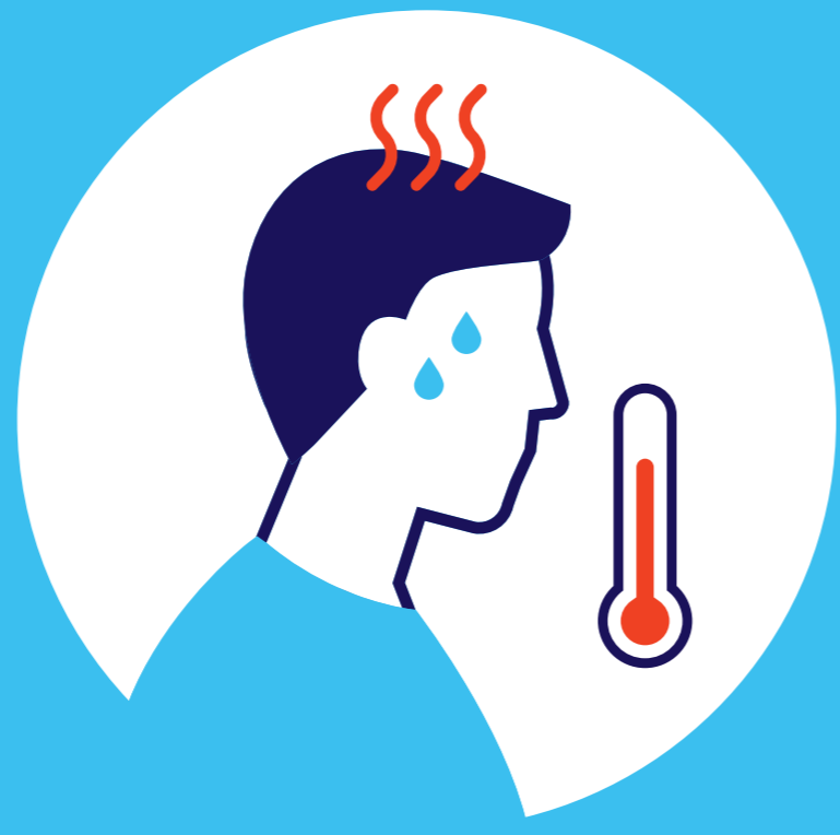
Fever (at least 38°C)